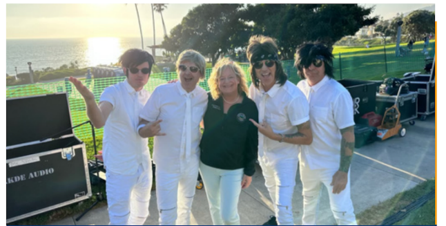
Flashback Heart Attack at Salt Creek Beach