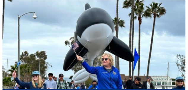
Festival of Whales Parade