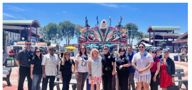
First Day of the OC Fair