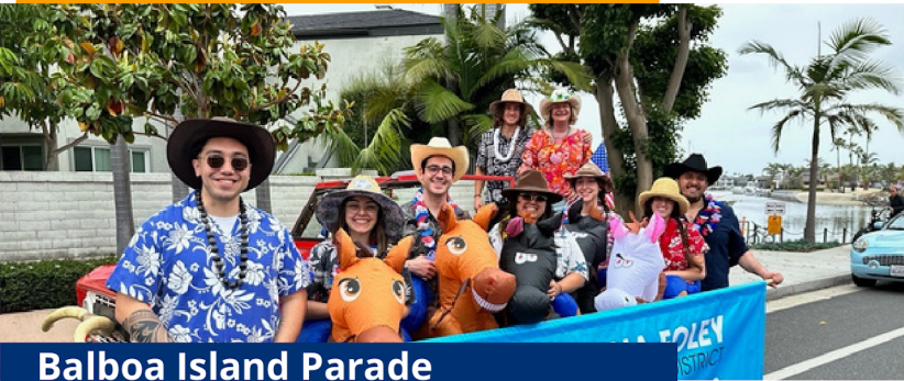
Balboa Island Parade