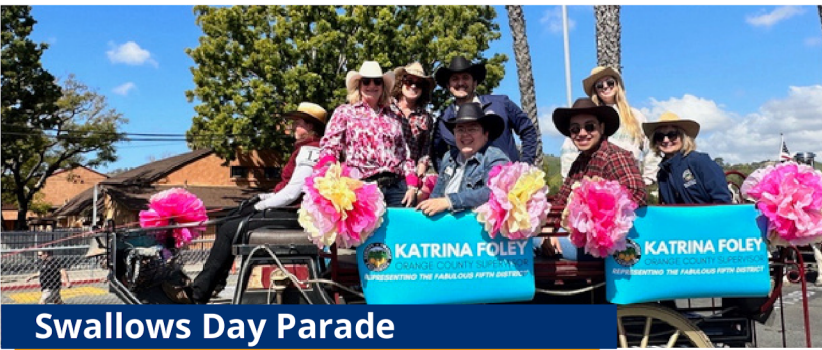
Swallows Day Parade