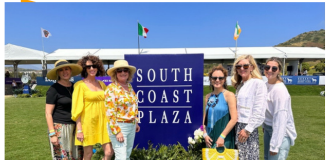
FEI Nations Cup